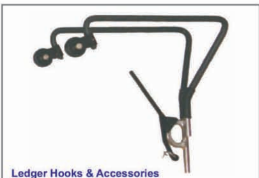
Ledger Hooks & Accessories