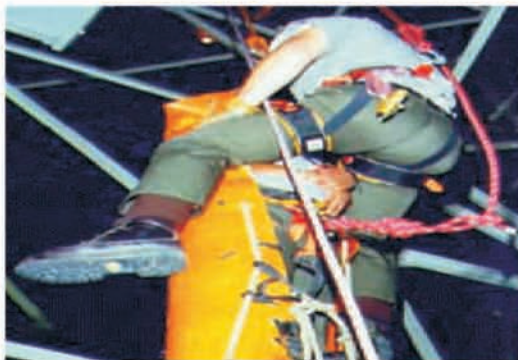
Confined Space Rescue Stretcher Kit