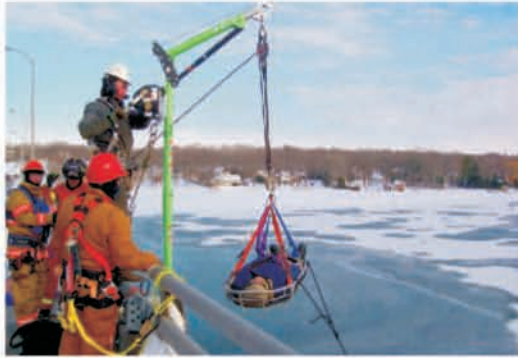
ANSI / CE / AZ-NZ Approved