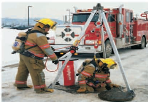
Advanced Continuous Feed Rope Winch 2 speed ( 9:1 Power Drive & 4:1 Manual )