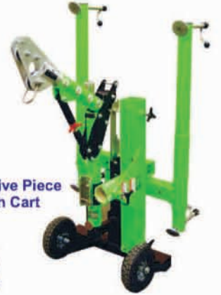
Advanced Five Piece Hoist with Cart