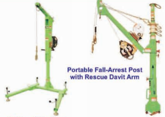
Portable Fall-Arrest Post with Rescue Davit Arm