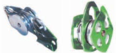
Opening Line In Double Entry Pulley