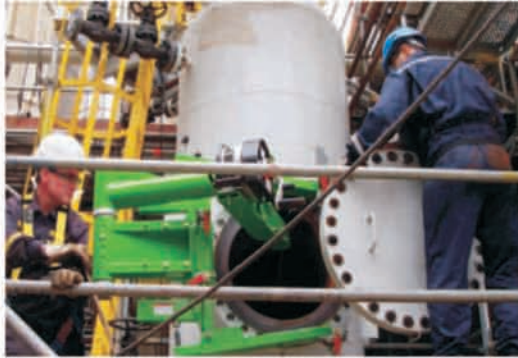
Advanced series Hoist System with Man Rated Safety Winch ANSI & CE APPROVED