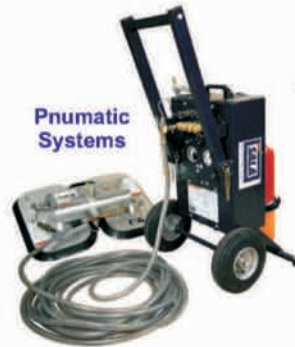
Compressed Air Bottle Power